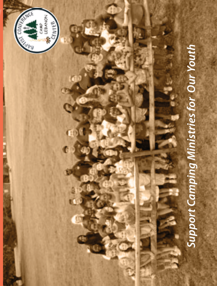
Support Camping Ministries for Our Youth

Contact the Foundation office about upcoming grant opportunities.